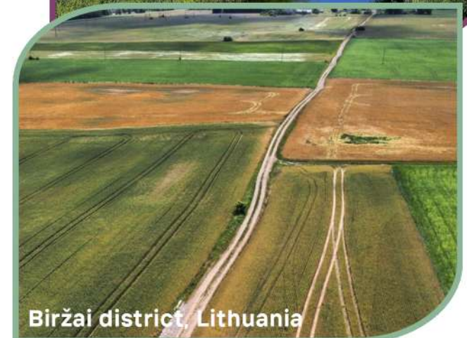
Biržai district, Lithuania